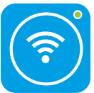
Comms - General