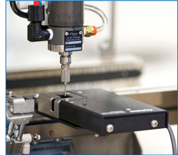
Optional Needle Sensor Module

Tested chemistries: acrylics, silicones, urethanes, UVcure, water-based Tested materials viscosity range: 0 to 850 cPs For higher viscosities, contact the factory Maximum deposition speed: 500 mm/sec Dot size down to: 1.2 mm \pm 0.06 mm