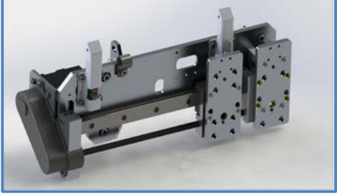
Dual-Simultaneous Programmable Pitch