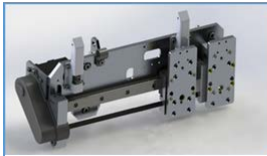
Dual-Simultaneous Programmable Pitch

Nordson ASYMTEK +1.760.431.1919 2747 Loker Avenue West Carlsbad, CA USA 92010-6603