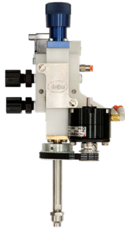
SC-104 Heated, Circulating Film Coater

The Prime SC-104/105 Film Coater Fluid System optimizes throughput and increases yield by delivering high velocity, excellent edge definition, and the ability to program and use a variety of coating widths.