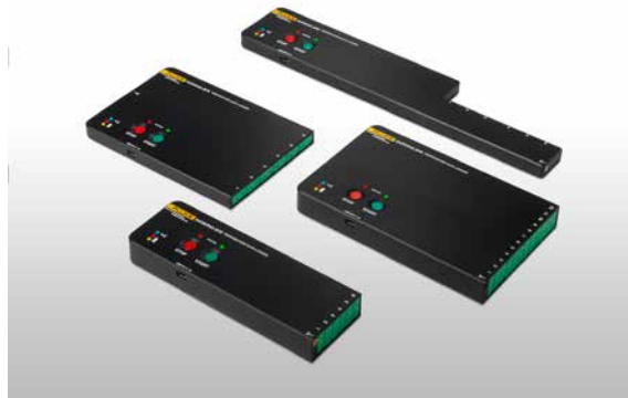
Datapaq DP5 data loggers

Included in Reflow Insight is the Easy Oven Set up (EOS) recipe calculation tool. EOS automatically calculates and informs the user of the optimum oven settings for a given product — saving time at every new product introduction.