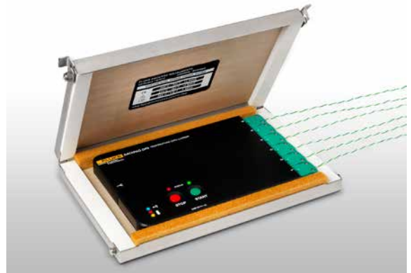
Datapaq DP5 data logger in thermal barrier

The Datapaq DP5 data logger can be specified with the optional TM21 radio telemetry system. This system has been designed specifically for use in high temperature conditions and providing the temperature readings in real time has proven its value in application from food cooking to steel slab reheating.