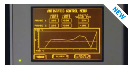
Anti Static Monitoring

This new feature is a unique, fully adjustable support system ensuring the boards being processed are held in contact with the top cleaning module regardless of width and or thickness.