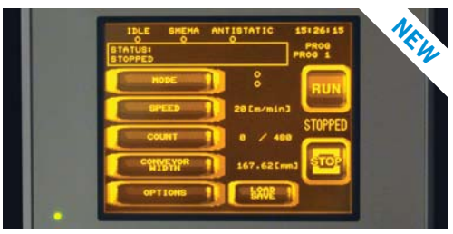
Touch Screen interface

Note: Different types of Product Guides are available depending on the material to be processed.