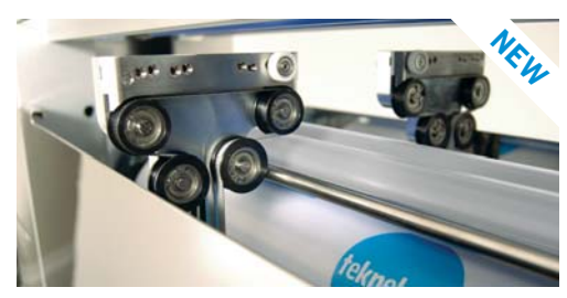
Internal Conveyor System

\it Note: Original Teknek elastomer rollers and pre-sheeted adhesive combination is available in all new SMT's.