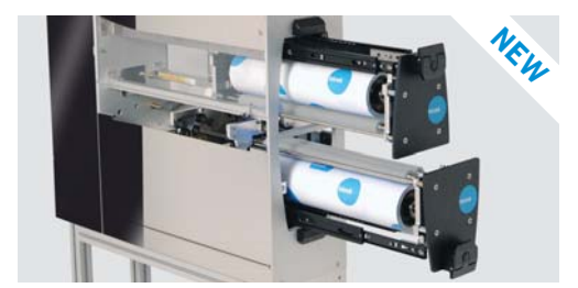
Access to the Teknek Cleaning Core Nanocleen™

Innovators in contact cleaning, Teknek have responded to changing customer demands and with Nanocleen have re-invented contact cleaning technology. Operators have full access to both cleaning rollers and Teknek pre-sheeted adhesive rolls, ensuring full integration of the SMT Clean Machine into the production line.